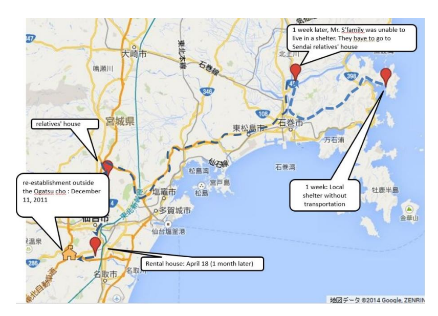
Fig. 4 Housing Reconstruction Paths of Mr. S

The reconstruction project decision process has been summarized based on administrative data (Ishinomaki City, MLIT: Ministry of Land, Infrastructure, Transport and Tourism) on public civil engineering projects related to reconstruction, along with interviews with resident groups.